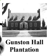
Gunston Hall Plantation